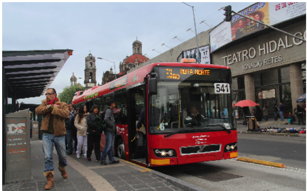
Passengers board a bus along Line 4 of Mexico City’s Metrobus bus rapid transit network.

When Mexico City’s first bus rapid transit (BRT) route was still in the planning stages a decade ago, the Metrobus represented one of the earliest