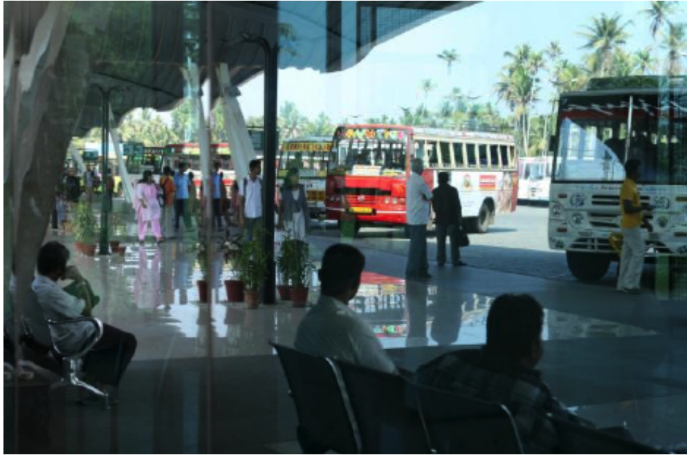
The Vytilla multi-modal transportation hub on the outskirts of Kochi, India

This usually leads to the third step, which is to implement a pilot project realizing one of the group's ideas. In the case of the Manila workshop, this led to redesigning pedestrian areas around the transit station. Other pilots are more ambitious, including a multi-modal transportation hub in Kochi, India, and an electric vehicle network in Seattle. Finally, as a coalition of stakeholders forms around these pilots, a new, localized link tank is created. To date, there are 22 cities in SMART's global network of "New Mobility Hubs" (yet another example of Zielinski's unique terminology), which started with an invitation to Bangalore, then to Cape Town ahead of the 2010 FIFA World Cup, then to Brazil and beyond. Just as workshop participants share their individual perspectives in search of a larger vision, SMART coordinates the exchange of knowledge and best practices between nodes in the larger network.