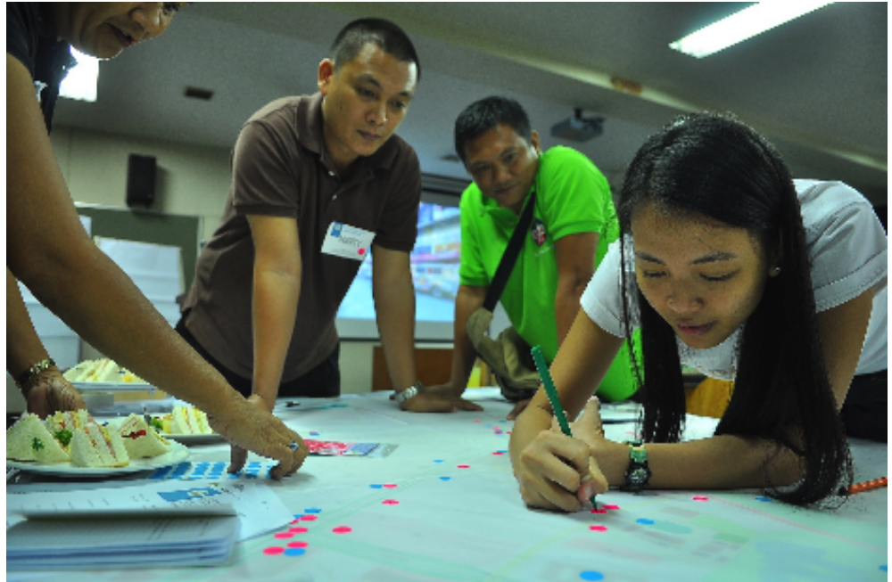
Participants of a SMART workshop in Metro Manila map transportation assets using colored stickers.

In February 2012, thirty-eight local businessmen, government officials, open data experts, academics, planners, architects, and high school students filed into a room in Quezon City—the most populous arm of Metro Manila—to map out their small corner of the mega-city. 40 They had just finished a walking tour of Quezon’s central business district, paying particular attention to the northern terminus of Manila’s rapid transit system, where a chaotic mix of taxis, buses, and “jeepneys” (vintage US Army Jeeps retrofitted into matatu-like mini-buses) swirled around. Sorted into small groups and armed with multi-colored stickers, participants traced the points at which all of these systems intersected, seeking spots at which to combine modes and forge new connections between the assembled stakeholders.