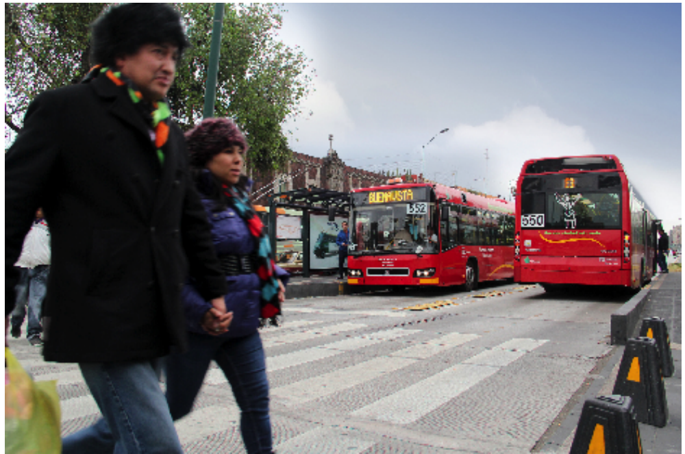
A pair of Metrobuses traveling in opposite directions along Line 4 in Mexico City

Advocacy networks seek to change the agenda or policies of governments, corporations, or other institutions, typically mobilizing large numbers of diverse participants with Internet-fueled campaigns. EMBARQ is perhaps less populous than the average campaign on Avaaz.org, but it nevertheless plays an important role in advocating for the adoption of sustainable transportation solutions around the world. For example, in addition to implementing projects at the municipal level and drafting policy at the national one, EMBARQ's international network of research centers seeks to leverage past successes in new contexts. For example, CTS-México was able to transfer its experience in organizing Metrobus drivers to Rio de Janeiro, Brasilia, and Belo Horizonte where EMBARQ Brazil assisted in launching 154 km of BRT 59 in time for this year's World Cup. Similarly, the lessons learned in tendering and contracting for new buses have been well received in India.