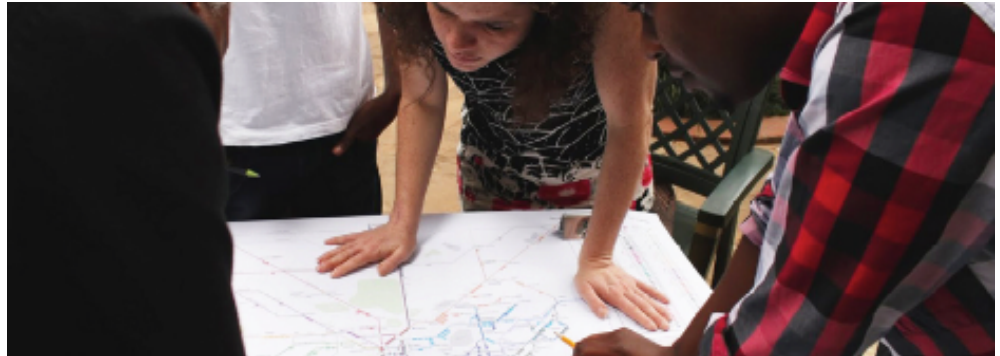
The Digital Matatus team studies the maps designed by MIT’s Sarah Williams (center).

In Nairobi, “Hitler,” “Gangsta,” “Psycho,” and “Gucci” aren’t the nicknames of aspiring hip-hop artists or criminals, but of local bus routes. 14 The buses in question are matatus, garishly decorated 14-seaters infamous for their speed, recklessness, and cash-only operation. They became essential to the daily commutes of nearly a third the city’s 3.5 million inhabitants 15 after the city’s regularly-scheduled bus service collapsed in the 1990s. 16